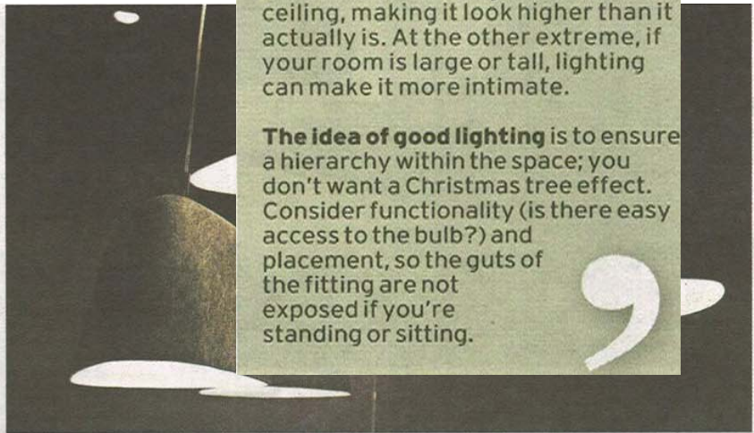
TOM DIXON FELT SHADES, $372 EACH, FROM DEDECE.