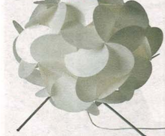
KNAPPA KLOVER FLOOR LAMP, $139, FROM IKEA.