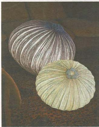
HAPPY DAYS (46) FLOOR LAMPS IN CRUSHED SILK, $3149 EACH, FROM ECC LIGHTING.