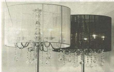
PARIS FLOOR LAMPS IN BLACK OR WHITE, $495 EACH, FROM BEACON LIGHTING.