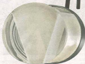
JAZZ CRYSTAL WALL LIGHT $595, FROM FABBIAN.