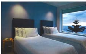
BELDW: The sumptuous guest accommodation is unexpected in a 'beach house'.