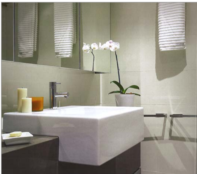
BOVE: The master bedroom's luxurious ensuite blends beautifully with its overall colour scheme.

What they wanted was a durable house in the time-honoured beach-house tradition of no carpet to absorb sand and salt water, so it was tiled and made easy to clean just by mopping it down. The whole place has a single theme to make it uniform and free-flowing – "one colour, one Italian