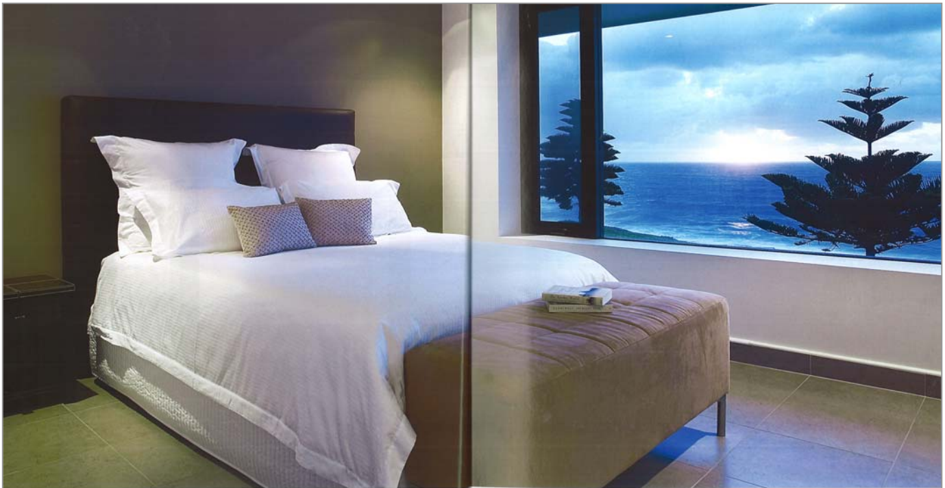
BOVE: The feature wall in the master bedroom is painted in Nile Clay by Dulux and the striking bedhead is custom-made in leather in a colour called 'dark chocolate'.

he declares. "If people come to stay, they've got their own quarters downstairs, but if we want to use it as an overflow area from ours, we can. It's always nice to have visitors when you go away on holidays," he smiles, "but then again, it's great to be able to give them their own space."