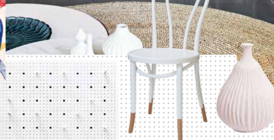
Baby Flower artwork by Rachel Castle, $450, Castle, castleandthings.com.au. Pegboard in Whitewashed Finish, $2100/2400mm x 1200mm x 18mm, Koskela, koskela.com.au. 'No. 18' chair in White with Natural Sock, from $368, Thonet, thonet.com.au. 'Camille' vase , $34.95, Papaya, papaya.com.au. 'Petunia' rug , from $660, Armadillo&Co, armadillo-co.com