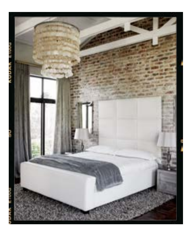
EXPOSED ORIGINAL BRICKWORK BRINGS rustic WARMTH TO A MODERN SPACE

Pressed tin, which can be spray-painted to match your decor, is another stylish (and relatively inexpensive) option, especially for kitchens and bathrooms. "It pulls the focus onto something more fun and inspiring than your appliances or vanity," says Emma Blomfield. Decorative pressed metal panels also look amazing overhead, adding old-world elegance to a space without architectural details.