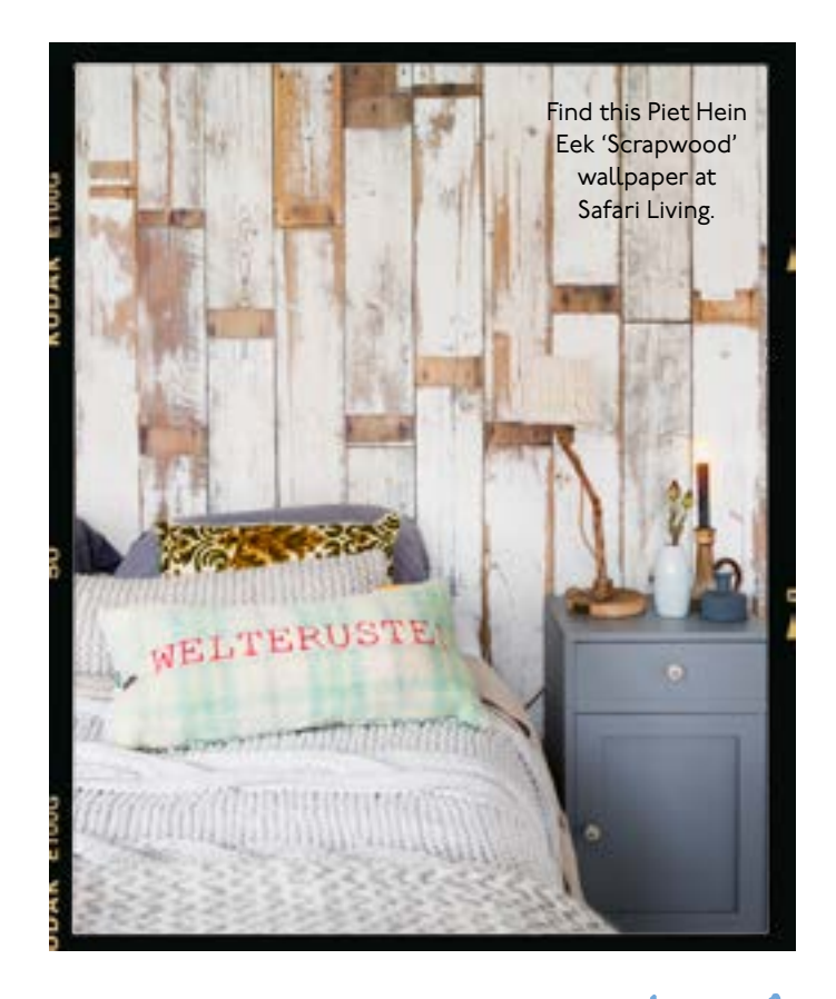
TAKE CUES FROM THE natural WORLD WITH WALLPAPERS THAT MIMIC TIMBER AND STONE